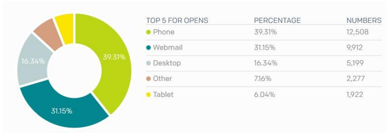
Figure 2: Below is a graph showing what people are using to view KNA e-mails: