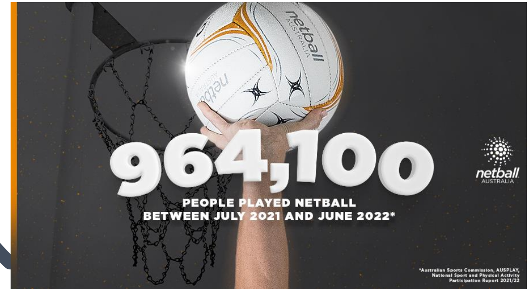
KNA - All Teams

How can we recruit new players, teams and clubs